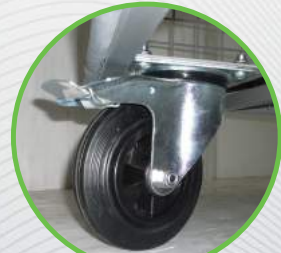
Medium & Large Braked Wheels